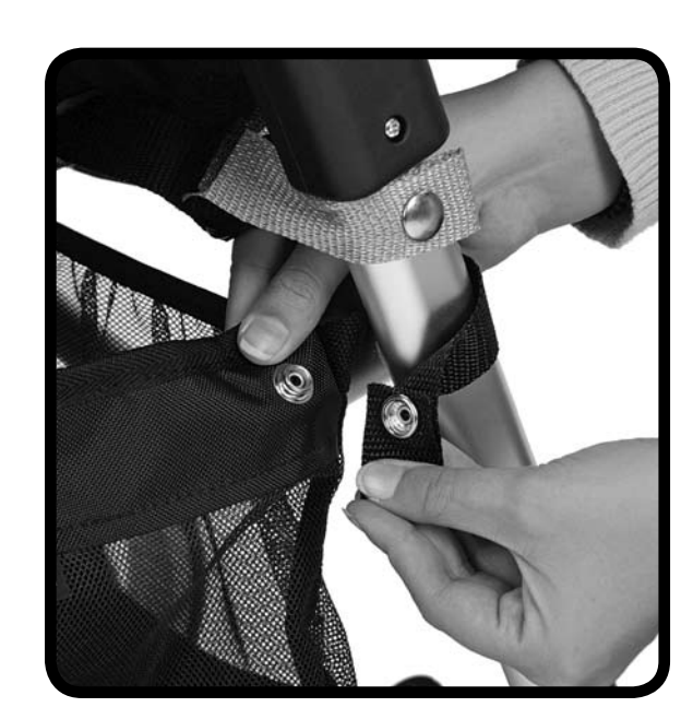
1 Wrap webbing around stroller frame tube.

NOTE: The rear of basket has the mesh material and the front does not.