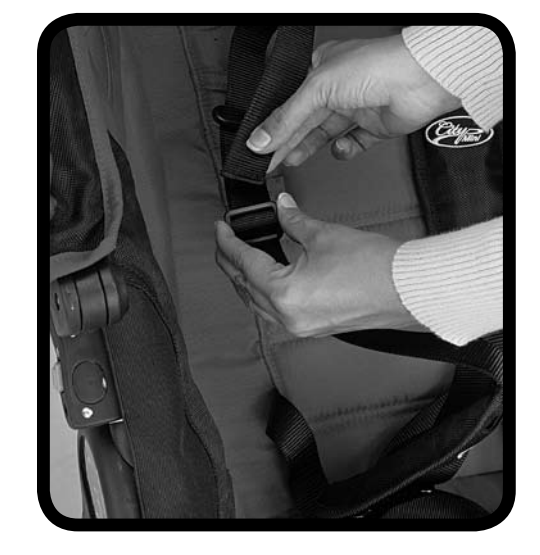
2 To adjust the shoulder and crotch strap length: Remove the shoulder pads and move the plastic guide up or down to lengthen or shorten.

WARNING: Engage parking device before loading and unloading passenger.