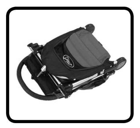
1. Unpack stroller from box and set wheels aside.