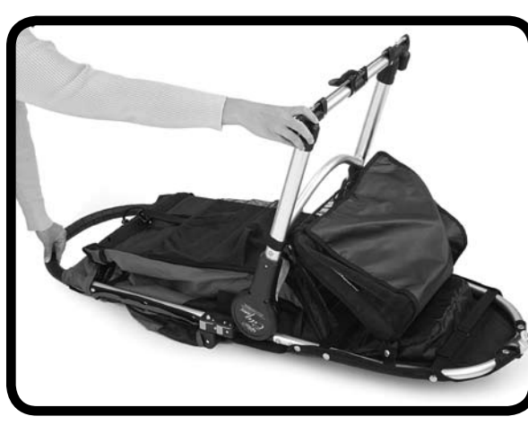
3. The stroller will click into place.