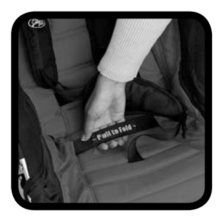
To fold stroller: Remove child from seat. Unsnap safety straps from frame and pull upwards on the fold strap with a gentle tug.

3 Secure seat straps around the bottom of the frame, behind the front wheel. Thread one seat strap through the D ring of the other strap, and fasten both Velcro sides firmly together.