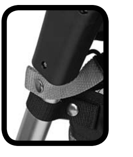
4 Secure safety straps to both sides of the frame before use.