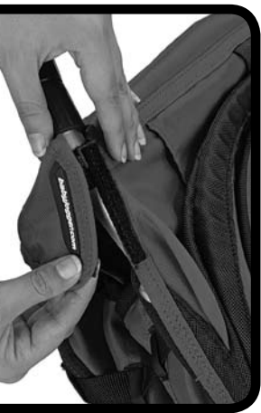
2 Secure top of seat around frame with Velcro tab, after snapping the webbing to the frame underneath.