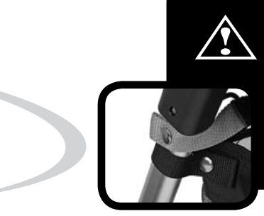
WARNING: Always be sure the safety strap is securely snapped onto the frame before using stroller!