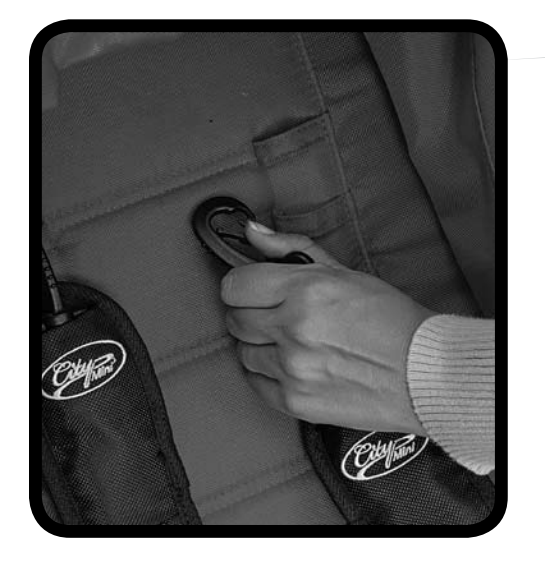
1 Unclip top of shoulder strap from the seat and re-clip on the pair of seat loops closest to child's shoulder height.